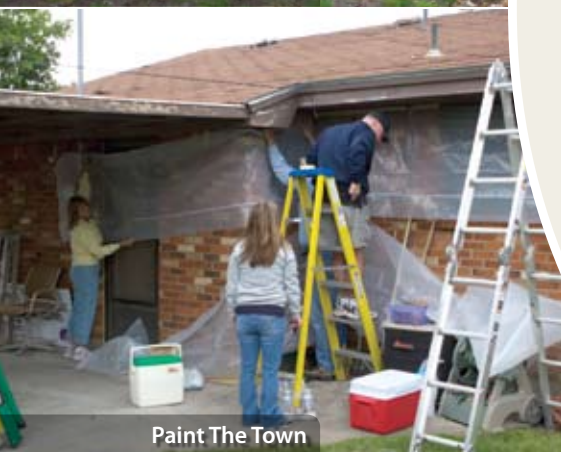
Paint The Town